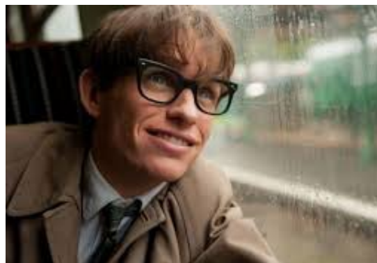
Oscar contender? Eddie Redmayne as Prof Stephen Hawking

The UK premiere is expected to take place in London on Tuesday 9 December and Britain's second biggest cinema chain, Cineworld, has given permission for Branches to hold bucket collections in any of their cinemas on Friday 2 January, the opening night of the film's general release.