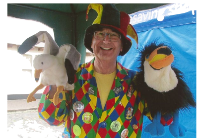
A colourful customer